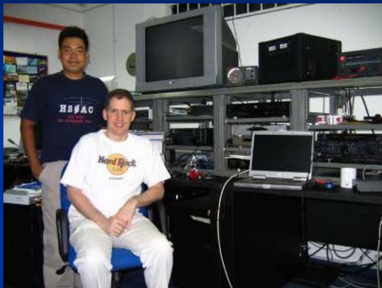
E21EIC and 9M2CNC