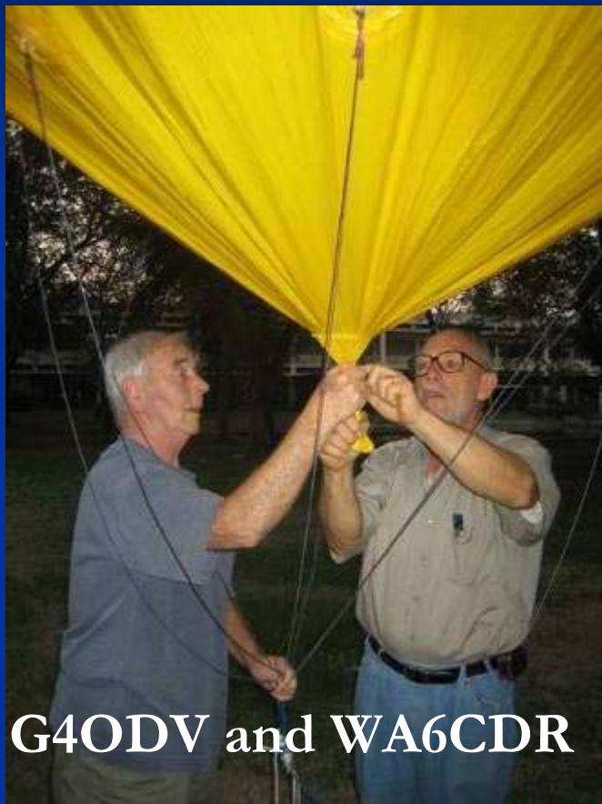
G4ODV and WA6CDR