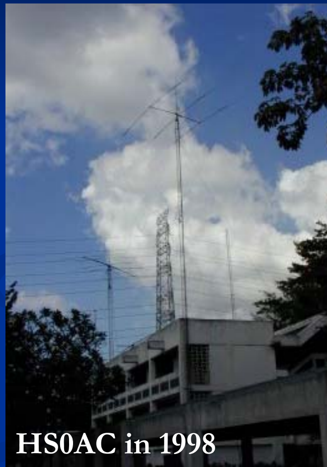
HS0AC in 1998

2007 DAYTON HAMVENTION CONTEST FORUM "BY E21EIC"