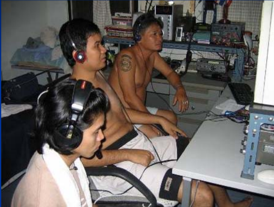
1 Radio 3 Headphones