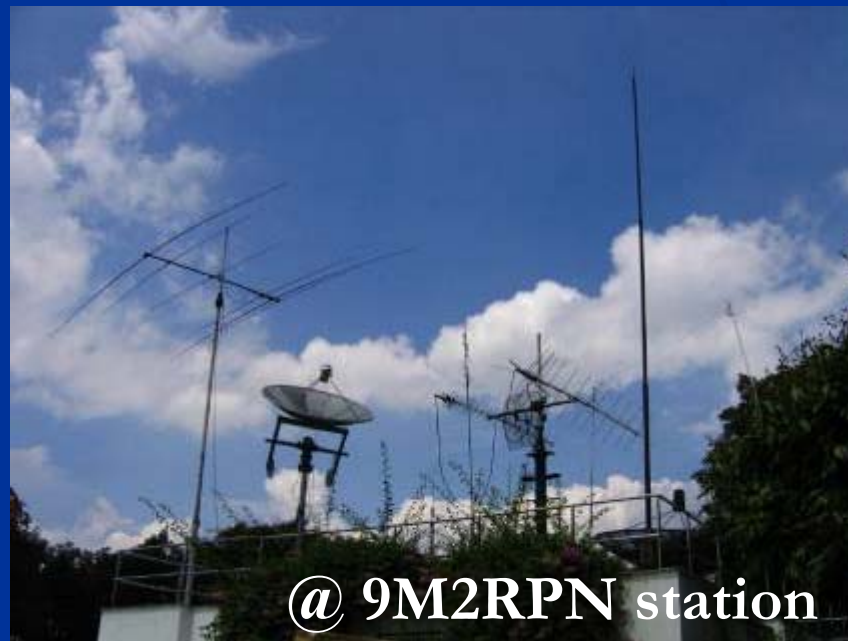
@ 9M2RPN station

2007 DAYTON HAMVENTION CONTEST FORUM "BY E21EIC"