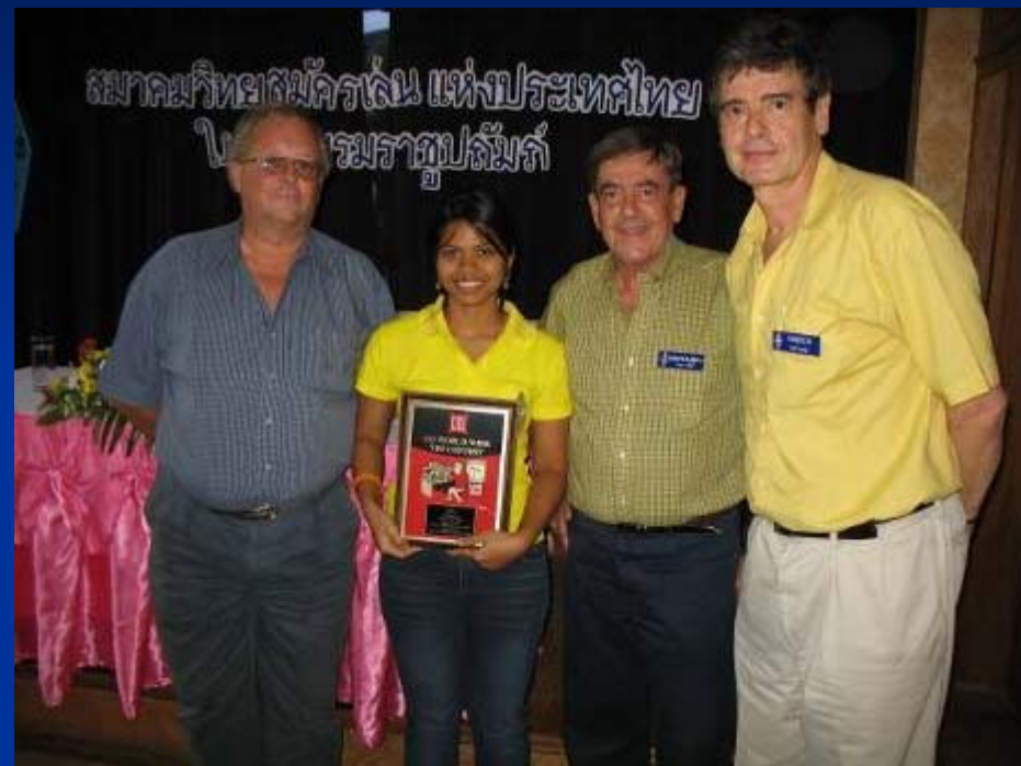
HS0ZDY, E20YGG, HS0/EA4BKA, HS0ZDX