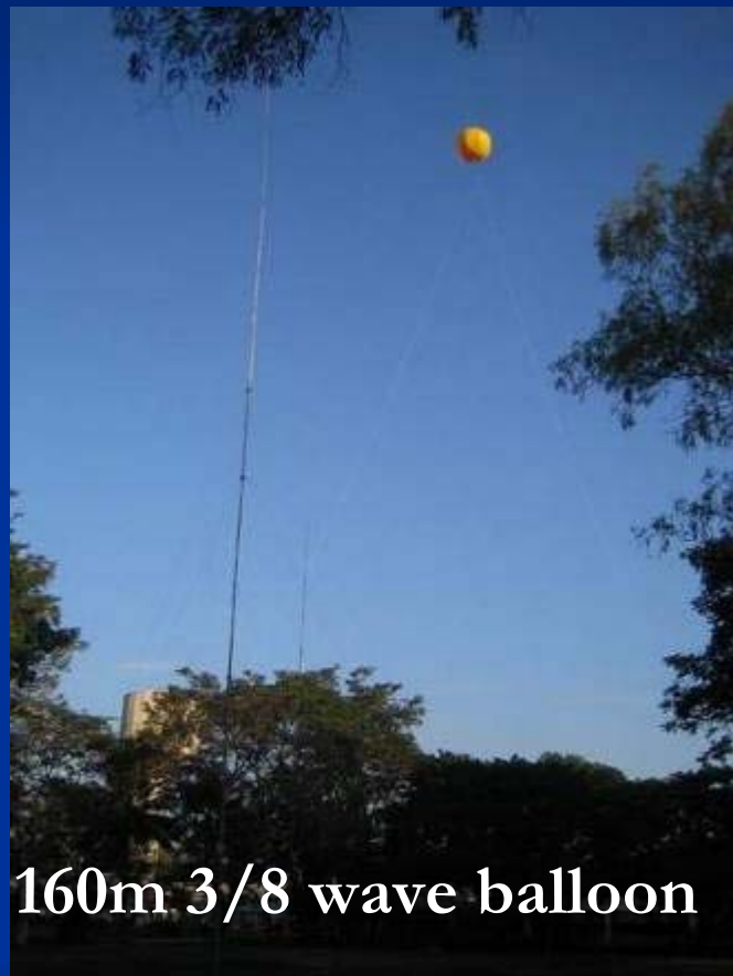
160m 3/8 wave balloon