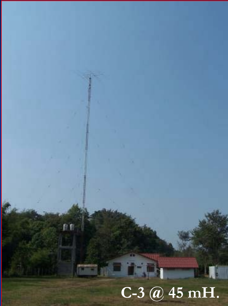
C-3 @ 45 mH.