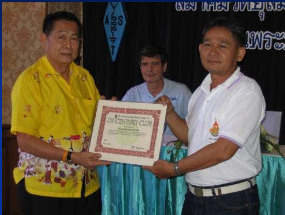
Help new ham get Award